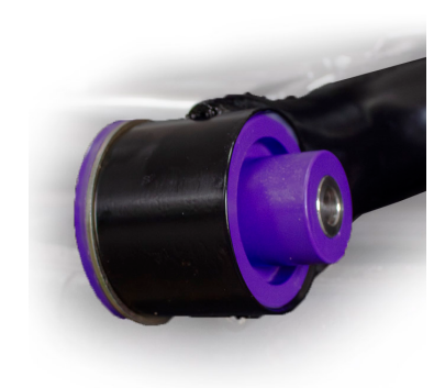
Figure 2 - Fitted